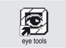
Figure: The desktop icon to launch eye tools